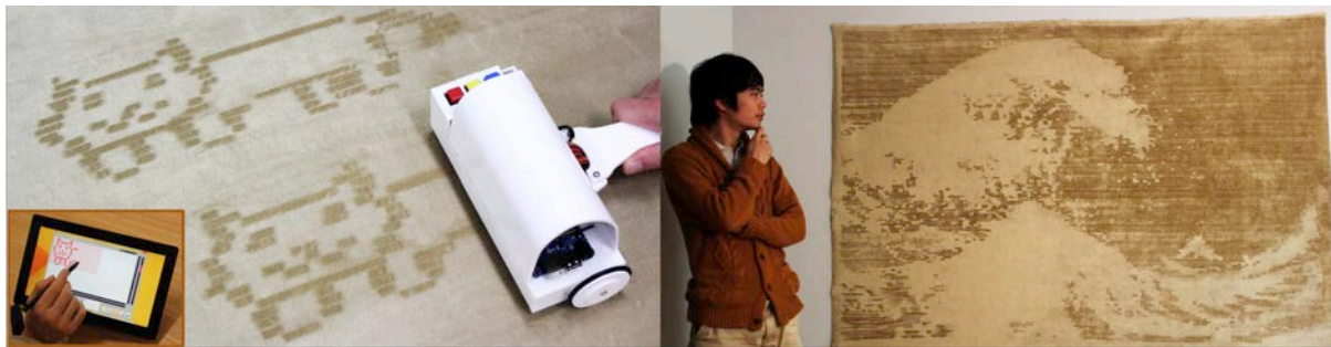
Figure 1: A user draws pattern on a tablet and the device draws the pattern on the carpet (left). The device can draw large images (right).