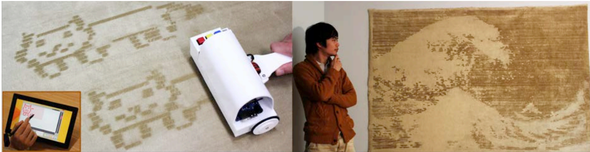
Figure 1: A user draws pattern on a tablet and the device draws the pattern on the carpet (left). The device can draw large images (right).