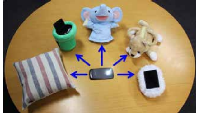
Figure 1: Implement with many soft objects

Soft objects are usually encapsulated with soft, fluffy materials such as cotton, wool, feather etc as their padding. These materials have many spaces in between the atoms allowing a flow of light to be spread out.