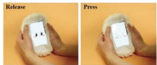
Figure 3: Interactive soft object

This work was supported by the Strategic Information and Communication R&D Promotion Programme (SCOPE) of the Ministry of Internal Affairs and Communications, Japan.