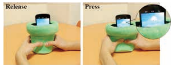
Figure 4: Game