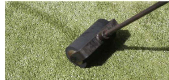
Figure 4: Patterns can be erased by grand roller.

Second, the user transmits the dot matrix data to the device and starts drawing the pattern on the fur surface by moving the device over its surface in the direction opposite to the fur growth direction. The surface needs to be fully flattened by hand before drawing. The user