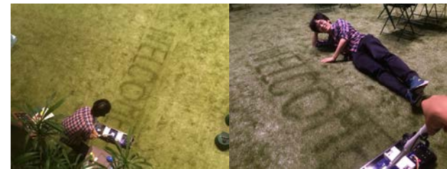
Figure 5: Displaying welcome message.

We exhibit our prototype system in a public demonstration space. Grass has been laid in the public space.