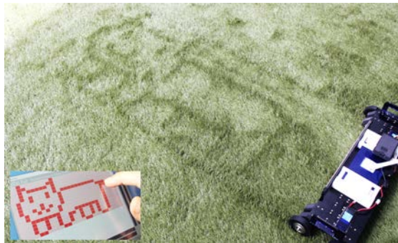
Figure 1: GraffitiGrass can converts grass fields into large canvas.

Our method doesn't require to use any ink and electric power to keep patterns. In addition, our technology can turn these ordinary objects into computer displays without requiring or creating any non-reversible modifications to the objects.