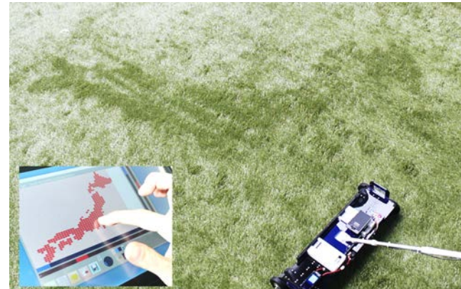
Figure 6: Large-scale can be drawn by divided into multiple segments.