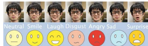
Figure 2: Variation of recognizable facial expressions

1) The standard of sensor data is set when user wears our device and makes neutral facial expression.